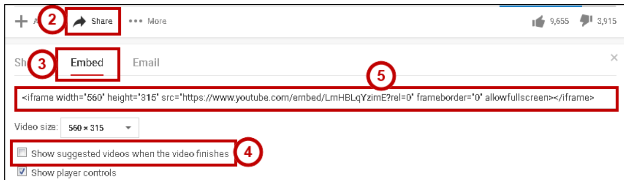
Figure 4 - Copying YouTube Embed Code