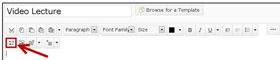
Figure 1 - Insert Stuff