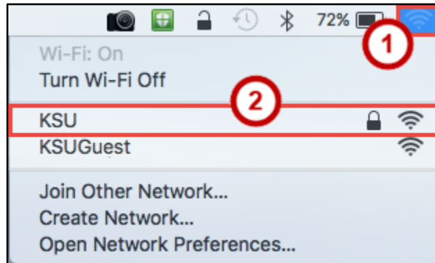
Figure 1 - Wireless Network Icon